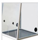
Three Side Glass Windows Back&Side glass windows maximize light and visibility, providing a bright and open working environment