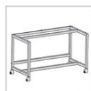
Base Stand Optional