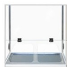
Folding acrylic front window, down part with free stop function