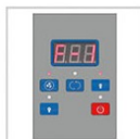
LED Display Digital LED display: Airflow Level