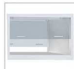
Double Sides Double sides work bench, operators can sit face to face