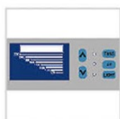
LED Display Microprocessor control system, LED display